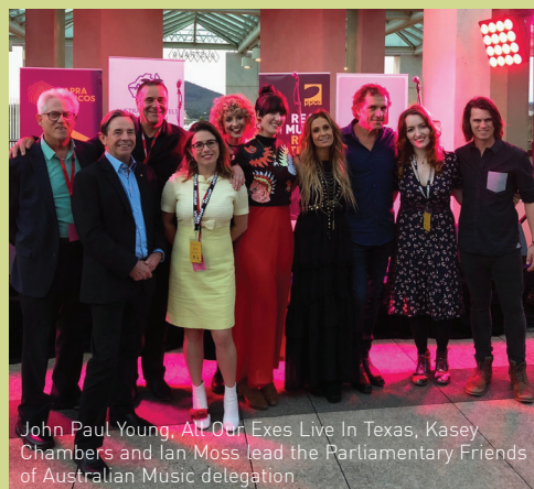
John Paul Young, All Our Exes Live In Texas, Kasey Chambers and Ian Moss lead the Parliamentary Friends of Australian Music delegation

A delegation of Australian songwriters, musicians, recording artists and key industry leaders came together at Parliament House in Canberra on 27 March to stress the importance of government support for the contemporary music industry at the third annual Parliamentary Friends of Australian Music (#PFOAM) Rock the House event.